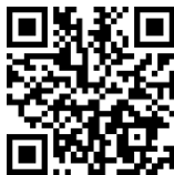
Marblelous Spiral Lift