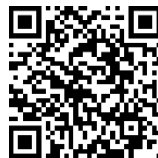
Troubleshooting and Tips